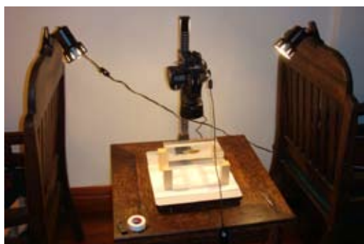
Photography using the chairs and a table in hotel room.

foldable close-up copy stand and a small light need to be carried along to the field. Photography equipments can then be set up using the desks and chairs in the hotel room.