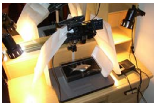
Photography using a desk in hotel room.

To photograph a specimen in field, whether in the native country or abroad, facilities of local research organizations such as local museums and universities can be used. If they have the equipments for specimen photography, such as close-up copy stand and appropriate lighting system, the specimen can be photographed at the organization as explained in STEP 8. However, if there is no such organization, specimen photography may have to be conducted elsewhere such as at the hotel of stay. In this case, a small