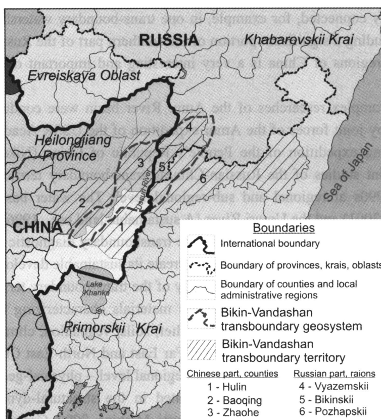
Figure 1. The Bikin-Vandashan Trans-boundary Geo-System and Territory

The state of natural environment is in many respects determined by the dynamics of anthropogenic using of the land, forest, water and other natural resources in the course of economic development of the territory. The natural statistical data on resources are organized by the units of the administrative-territorial division. Therefore, we study the Bikin-Vandashan trans-boundary geosystem environmental impact within the local level administrative units, on the territory of which it is located. We consider these adjacent units as the Bikin-Vandashan trans-boundary territory or the integral natural-economic object. This transboundary territory includes Pozharskii raion of Primorskii Krai, Bikinskii and Vyazemskii raions of Khabarovskii Krai on the Russian side. The Zhaohe and Baoqing counties of the Shuangyashan region and Hulin county of Jixi region of Heilongjiang province form the Chinese part of the territory (Figure 1).