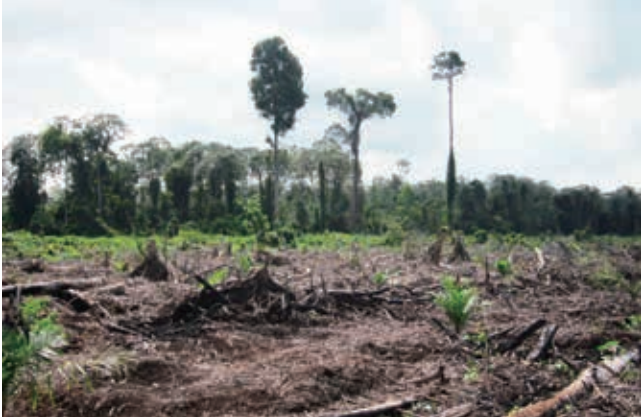
▲ Figure 6. Remnant forests play a role as biodiversity reservoir and natural buffer to enhance species diversity and the recolonization of forest-adapted species.

whereas the level of ecological degradation increased with distance. In general, in this study, both peat vegetation variables and ecological degradation were important in shaping the termite and ant communities of tropical peatlands, but their relative importance was not significant in fire-impacted peatlands, regardless of distance from the remnant forests.