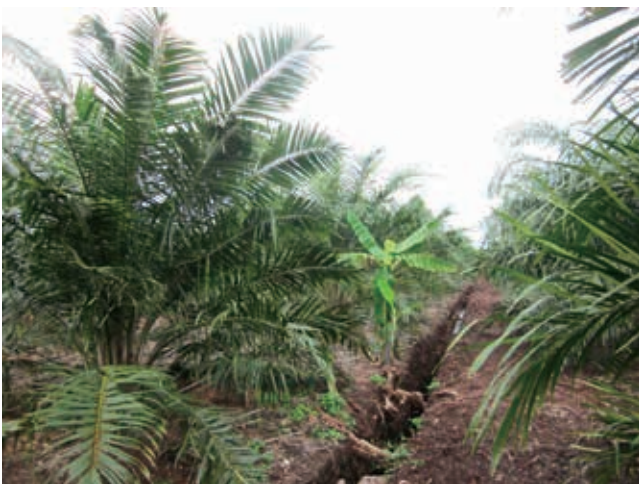
▲ Figure 5. Burnt peatland cultivated with oil palm.

were absent from the fire-impacted peatland. Most wood-nesting termite colonies were detected inside incompletely charred tree branches and barks. This suggests that tree branches and barks might have provided the termites with refugia from heat during the fires and from flooding during the raining season. The high similarity in species composition in recently burnt peatland, long-ago burnt peatland, and peatland cultivated with oil palm trees implies low species turnover, regardless of how long ago the fire-impacted peatlands were abandoned or cultivated. This result does not necessarily imply that the fire-impacted peatlands did not favour the colonization of termites but instead that there is spatial dependence.