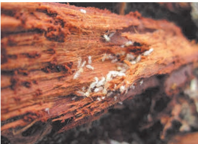
▲ Figure 1. Termite is omnipresent in tropical peat forest ecosystem.

Tropical peatland is the dominant landscape in the Indo-Malayan region. It globally accounts for approximately 72% of tropical peatlands, stretching out over mangrove forests, peat swamp forests, and freshwater swampland forests. A recent statistic showed that these highly disturbance-sensitive forests are massively exploited, with a decline of 5.1 million hectares or 42% of the total current area of intact peat swamp forest, compared with the area of forests two decades ago. In the meantime, the area of abandoned secondary peatland increased twofold to 2.3 million hectares or 15% of the total area. The extensive anthropogenic activity in the form of deforestation for valuable logs and land conversion into agro-industrial plantations, together with the associated groundwater draining, increases the risk of peat fires. Furthermore, prolonged periods of annual droughts and floods may result in a drastic change in the environmental conditions of peatlands. As a consequence, peat swamp forests support lower species diversity than tropical rainforests. However, these forests are known to be the habitat of some ecological dominant terrestrial and aquatic species, particularly peat-dependent species, which potentially contribute to the regional beta-diversity.