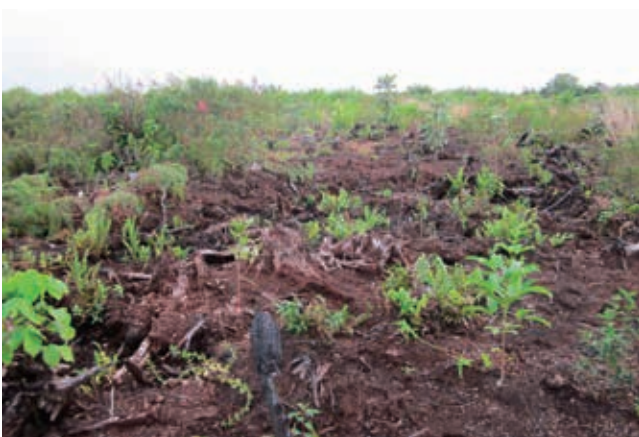
▲ Figure 4. Peatland burnt 8 years ago.