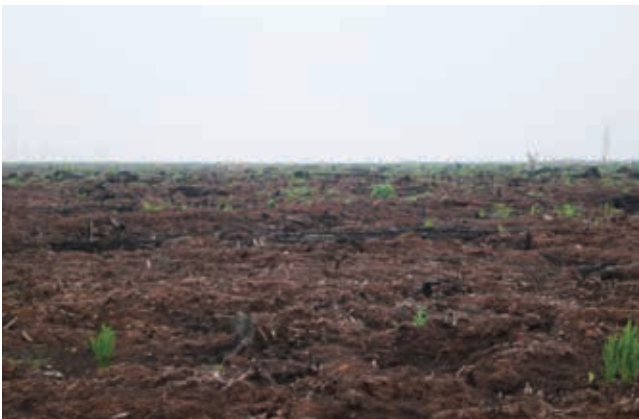
▲ Figure 3. Peatland burnt 6 months ago.

Overall, the termite species richness in fire-impacted peatlands decreased up to 40% of the total number of species found in peat swamp forests. The fires significantly changed the community structure of termites, with one family becoming dominant. In particular, only termites that nest inside wood (family Rhinotermitidae) survived through the fires. Termites that build mounds or nests in trees (family Termitidae)