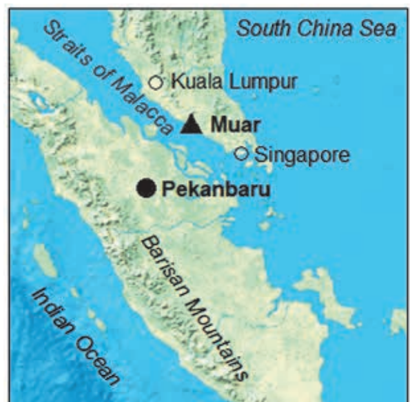
Figure 1. Locations of atmospheric observation stations: ● : Pekanbaru and ▲ : Muar. Major cities in the region.

The wildfire events in June 2013 and February–March 2014 were especially pronounced. During these time periods, intense peatland fires occurred in Riau (Gaveau et al. 2014). As a result, the PM 10 concentrations at these observation sites were higher than 500 μg m -3 and the maximum CO concentration exceeded 10 ppm. Importantly, the enhancements in the CO and PM 10 levels were well correlated (Figure 3). The value of the