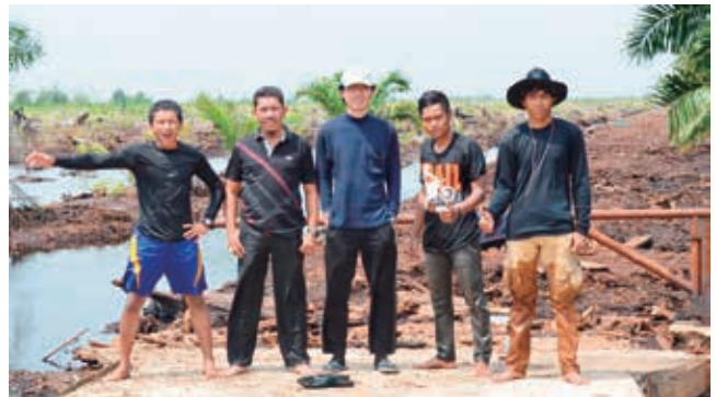
▲ Figure 2. Termite and ant surveys were conducted with the technical supports from Riau University. The author is at the center.